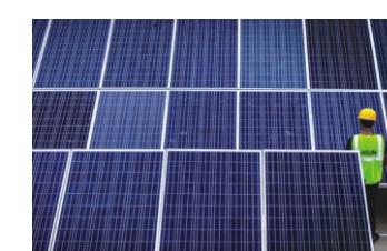
150KW Manesar Industrial