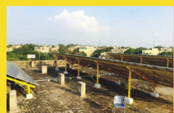
30KW Delhi Institutional