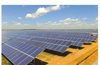
4.5MW Chattisgarh IPP