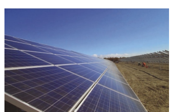
2MW Uttarakhand IPP