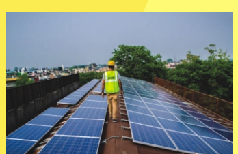
50KW Delhi Institutional