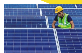
70KW Delhi Commercial