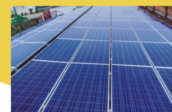
125KW Delhi Institutional

HOMES INDUSTRIES HOSPITALS EDUCATIONAL INSTITUTIONS COMMERCIAL & RESIDENTIAL COMPLEXES