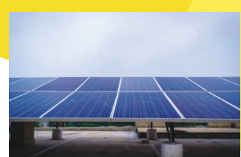
60KW Faridabad Commercial