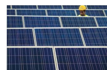
100KW Gurgaon Commercial