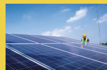
35KW Faridabad Industrial