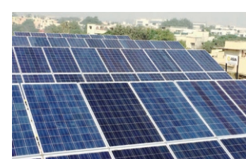
200KW Sahibabad Commercial